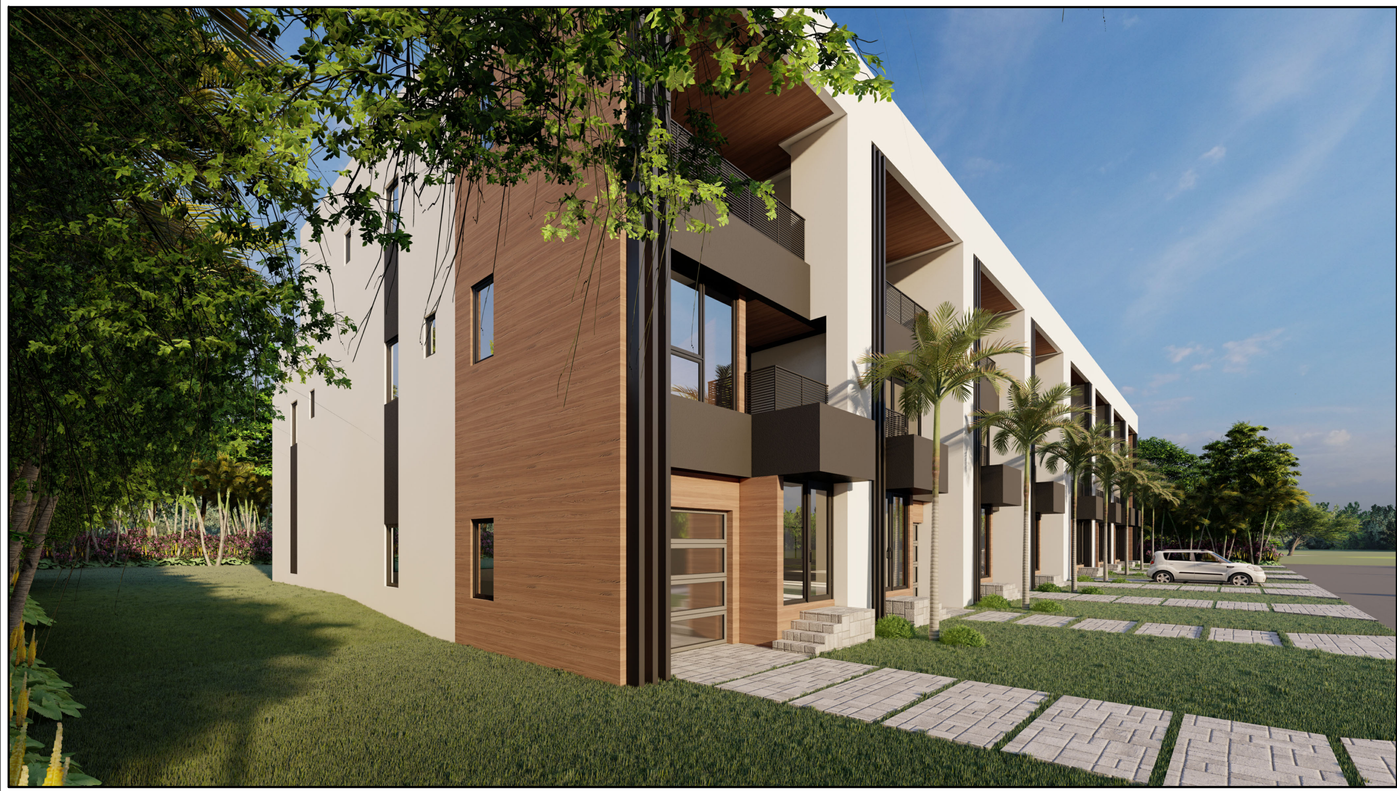
3D IMAGES - FRONT LEFT CORNER SCALE: NOT TO SCALE