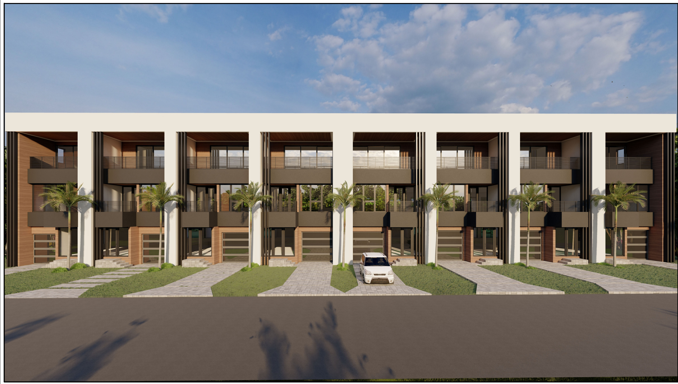
3D IMAGES - FRONT SCALE: NOT TO SCALE