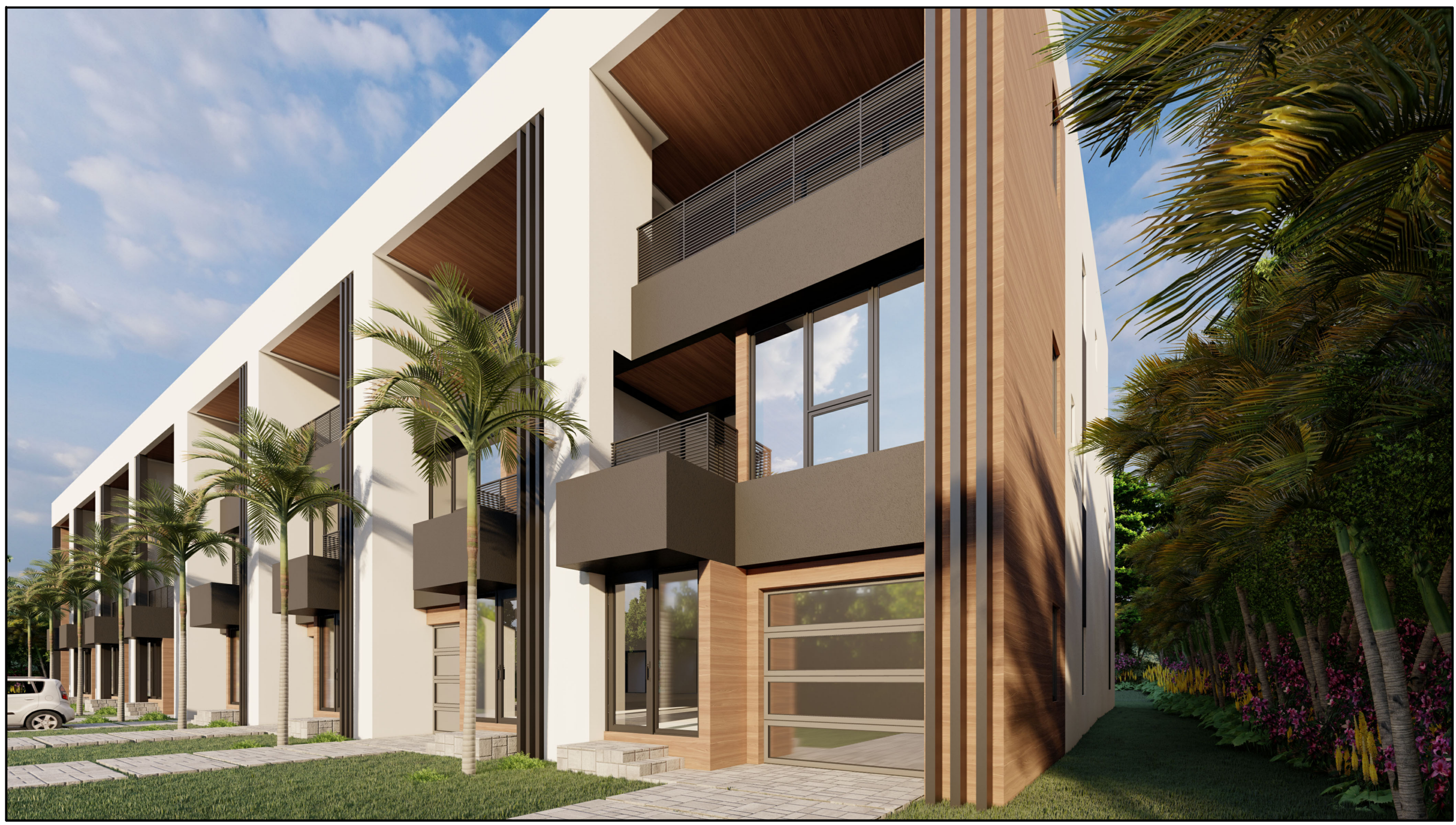
3D IMAGES - FRONT RIGHT CORNER SCALE: NOT TO SCALE