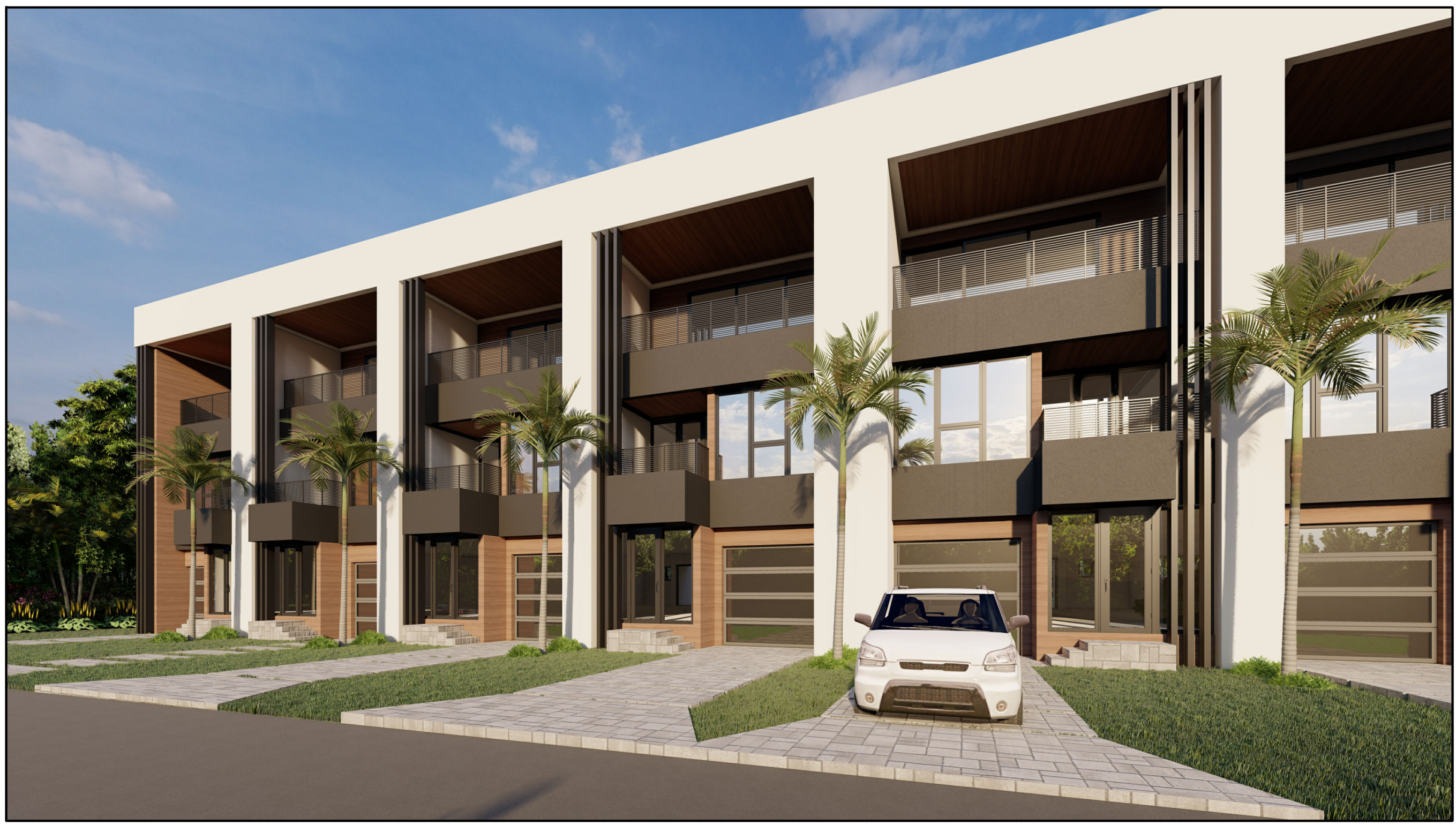
3D IMAGES - FRONT CLOSE SCALE: NOT TO SCALE